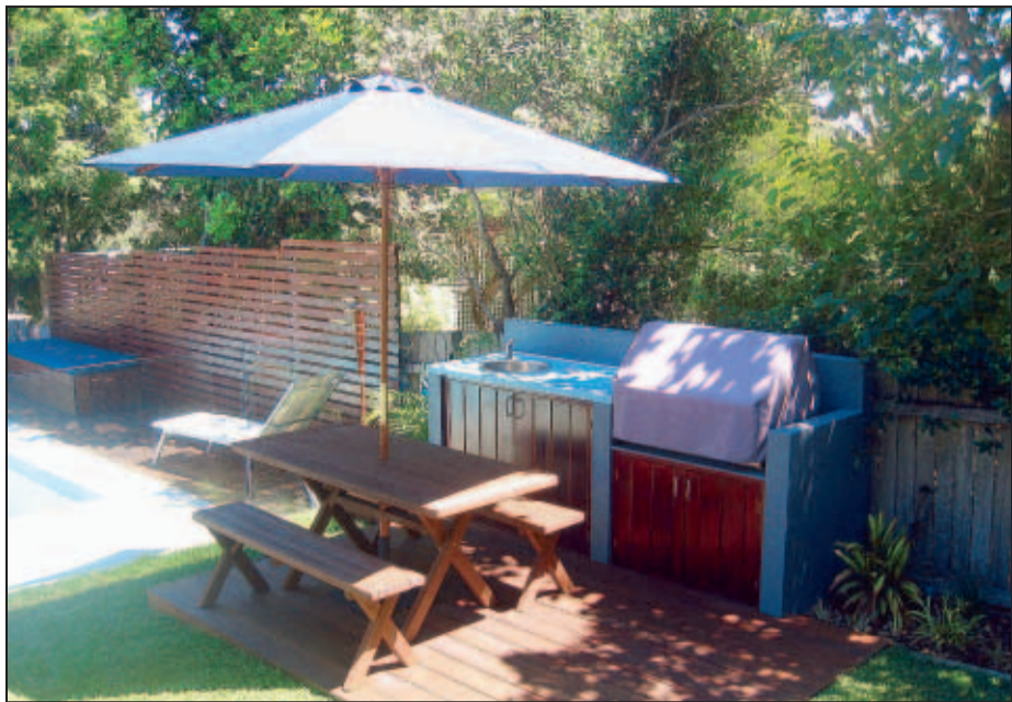
An example of Space Landscape Designs' handiwork