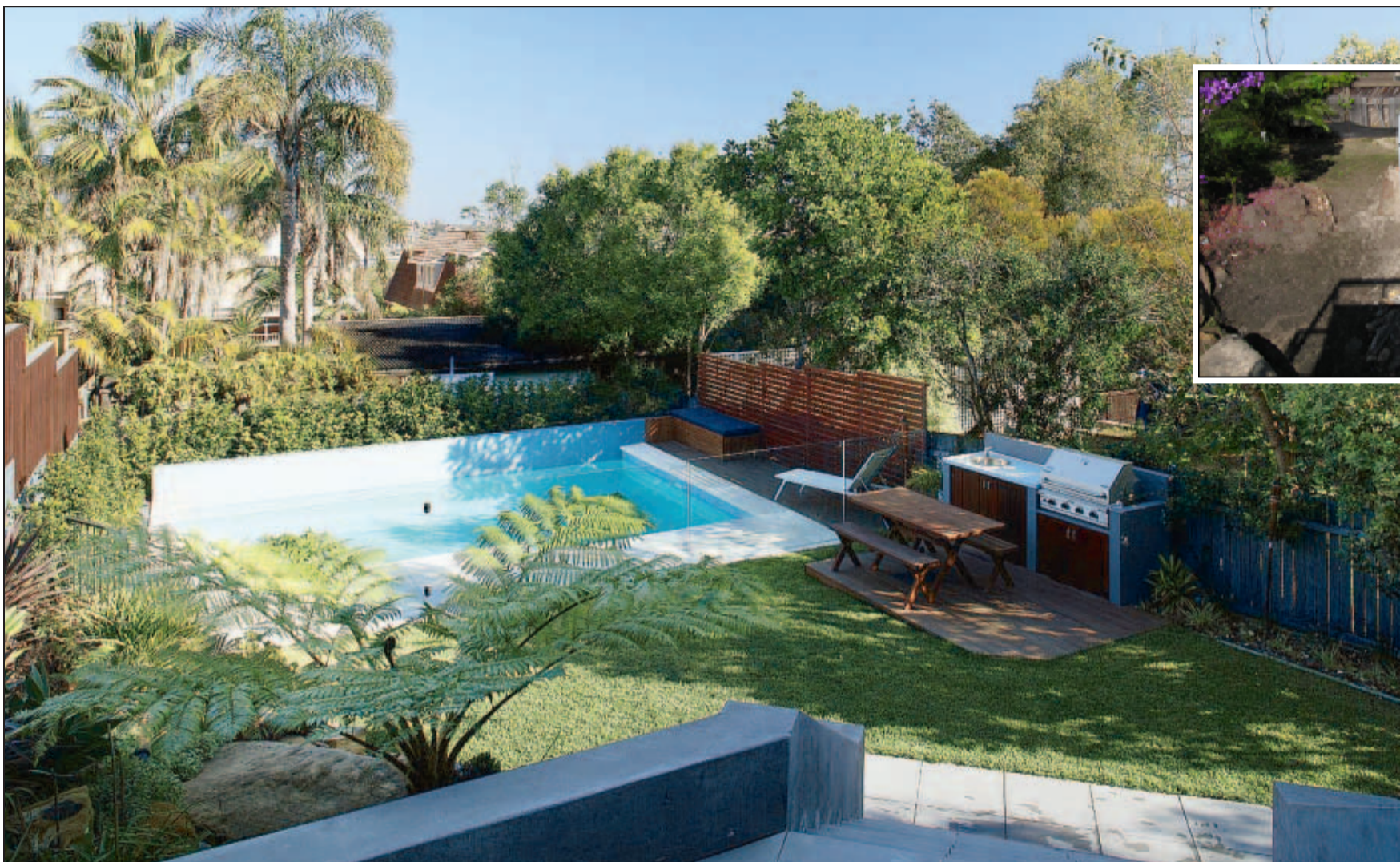
An outdoor room can add 15 per cent to your property's value (left) and (inset) the same home before the work.